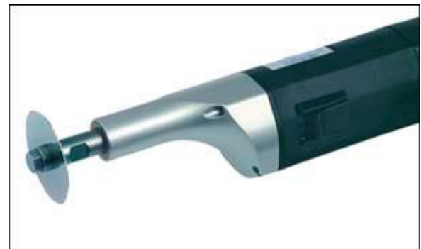
MST-Instrumente GmbH - manufacturer of plaster saws, autopsy saws and horse dental rasps

The Risk Manager has been used in the company since 2005 to prepare the risk management files. Since it was known that the solution had extension modules, for example for medical electrical devices, the brothers decided to evaluate the full version of Risk Manager first. Thus, all relevant requirements and standards were to be covered in one system in a clear and time-saving way. During the test phase, the company's employees were